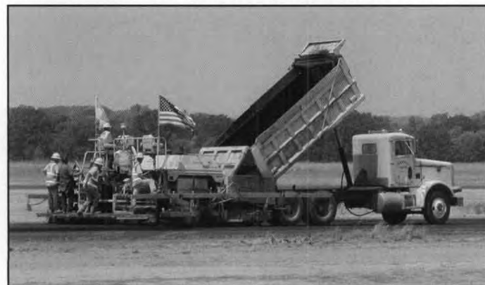
There was a fleet of big yellow trucks paving the taxiway right alongside the RC launch area; contestants flew without a problem.